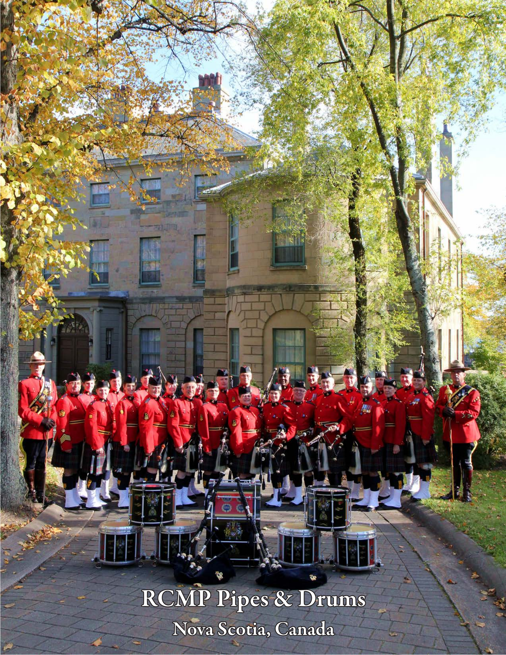
RCMP Pipes & Drums Nova Scotia, Canada